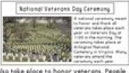
National Veterans Day Ceremony A national ceremony is held to honor and thank all veterans who served in each year on Veterans Day or 11/11 in the morning. The ceremony takes place at the Arlington National Cemetery in Arlington, Virginia. Many veterans attend the ceremony each year.

How Do People Celebrate Veterans Day? There are many different ways to celebrate Veterans Day. Because it is a national holiday, many schools, businesses, and government offices are closed. Having a day off work or school allows people time to reflect and show their gratitude to veterans. Many parades and ceremonies also take place to honor veterans. People can also honor veterans by personally thanking them for their service or writing a thank you letter.